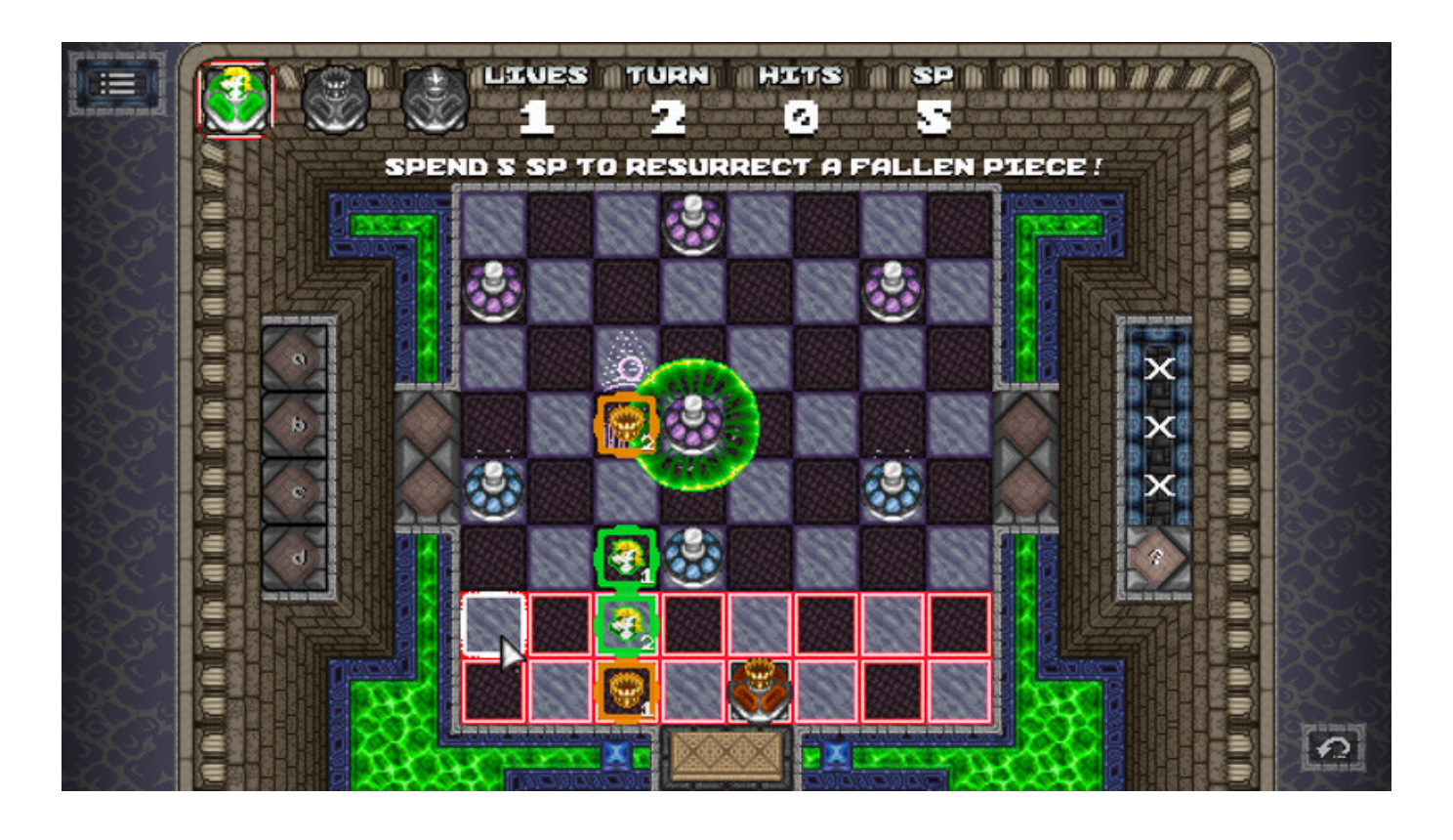
The Shape Of Heart - Episode II Crack